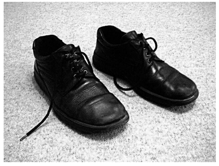
Your parents shoes