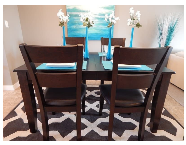
Dining Room Table